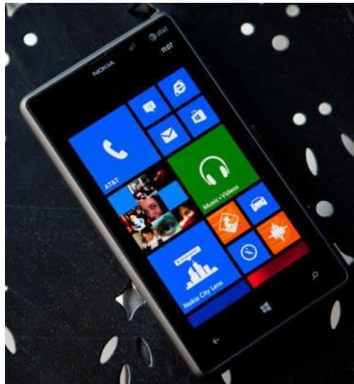
Lumia 820 series

series Along with the Lumia 810 for T-Mobile and the Lumia 822 for Verizon, AT&T's Nokia Lumia 820 downshifts from the chockablock 920 in price and hardware design but offers the same essential features, including a great screen and wireless charging capabilities